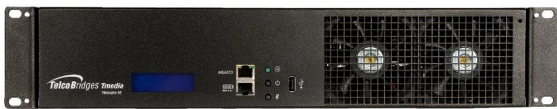
Tmedia TMG3200-TE, 2U VoIP gateway (Front View)