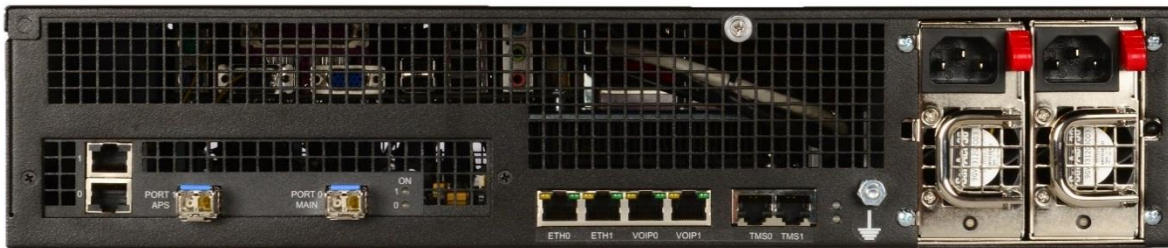
“Tmedia TMG7800-STM1 telecom unit, rear view”