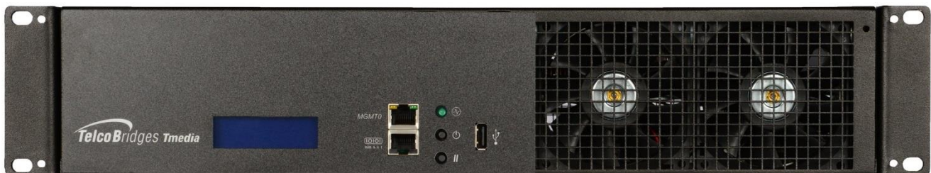
"Tmedia TMG7800 telecom unit, front view"