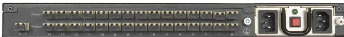
“Tmedia TMG7800-STM1-N+1 unit, rear view”