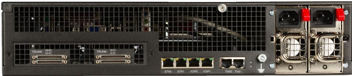
“Tmedia TMG7800-TE telecom unit, rear view”