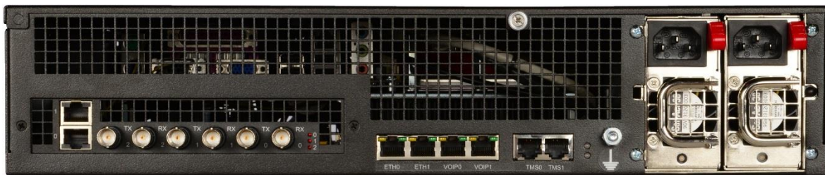
“Tmedia TMG7800-DS3 telecom unit, rear view”