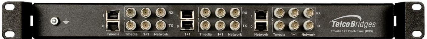
Tmedia TMG7800-DS3 1+1, Patch Panel (front view)