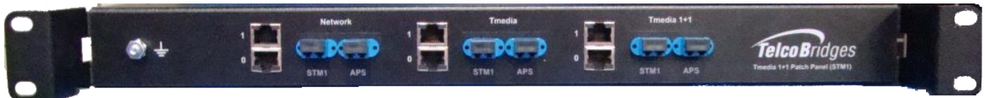
Tmedia TMG7800-STM1 1+1, Patch Panel (front view)

© 2017 TelcoBridges Inc. All rights reserved. The TelcoBridges logo is a registered trademark of TelcoBridges Inc. This document and any products or functionality it describes are subject to change without notice. Please contact TelcoBridges for additional information and updates.