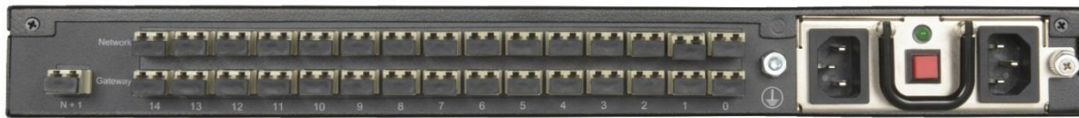
Tmedia TMG7800-STM1-N+1 unit, rear view