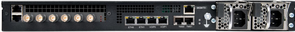
Tmedia TMG3200-DS3 AC (rear view)