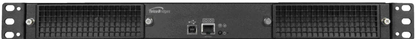
Tmedia TMG3200 (front view)

Operating temperature: 0 to +70 °C, 95% rel. hum. non-condensing Storage temperature: -10 to +85 °C, 95% rel. hum. non-condensing Designed to meet NEBS Level 3 RoHS compliant