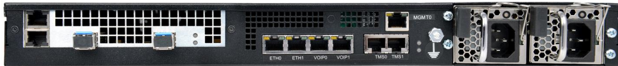
Tmedia TMG3200-STM1 AC (rear view)