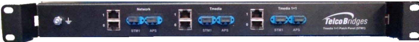
Tmedia TMG3200-STM1 1+1, Patch Panel (front view)

© 2016 TelcoBridges Inc. All rights reserved. The TelcoBridges logo is a registered trademark of TelcoBridges Inc. This document and any products or functionality it describes are subject to change without notice. Please contact TelcoBridges for additional information and updates.