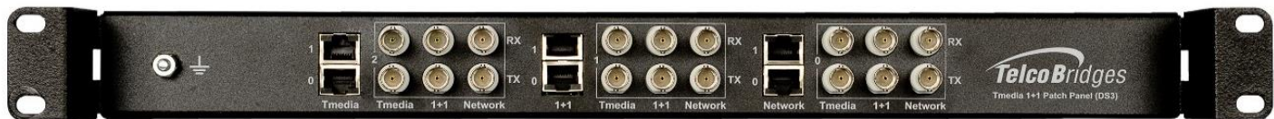
Tmedia TMG3200-DS3 1+1, Patch Panel (front view)