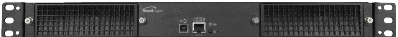
Tmedia TMG3200 (front view)

Operating temperature: 0 to +70 °C, 95% rel. hum. non-condensing Storage temperature: -10 to +85 °C, 95% rel. hum. non-condensing Designed to meet NEBS Level 3 RoHS compliant