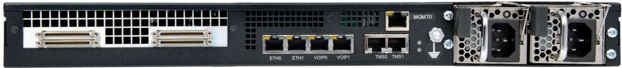
Tmedia TMG3200-TE AC (rear view)