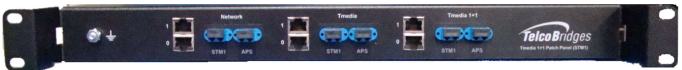
Tmedia TMG3200-STM1 1+1, Patch Panel (front view)

© 2017 TelcoBridges Inc. All rights reserved. The TelcoBridges logo is a registered trademark of TelcoBridges Inc. This document and any products or functionality it describes are subject to change without notice. Please contact TelcoBridges for additional information and updates.