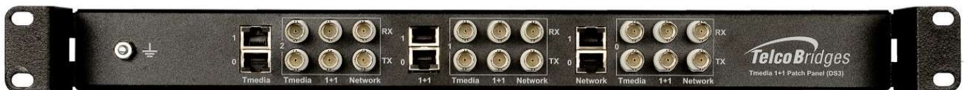
Tmedia TMG3200-DS3 1+1, Patch Panel (front view)