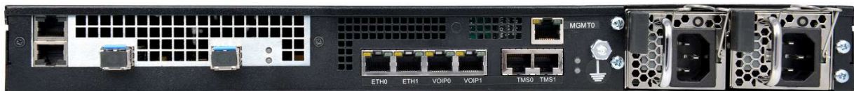
Tmedia TMG3200-STM1 AC (rear view)