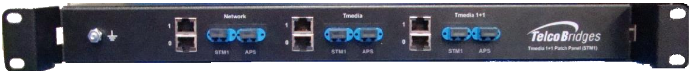
Tmedia/Tdev TMP6400-STM1 1+1, Patch Panel (front view)