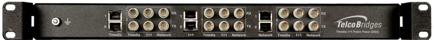
Tmedia/Tdev TMP6400-DS3 1+1, Patch Panel (front view)