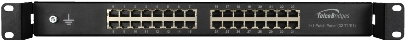
Tmedia/Tdev TMP6400-TE 1+1, Patch Panel (front view)