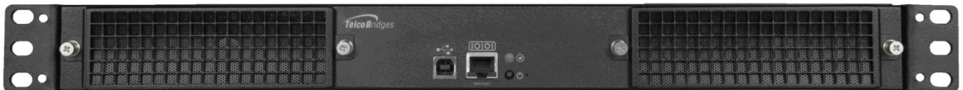
Tdev TMP6400 (front view)

Operating temperature: 0 to +70 °C, 95% rel. hum. non-condensing Storage temperature: -10 to +85 °C, 95% rel. hum. non-condensing Designed to meet NEBS Level 3 RoHS compliant