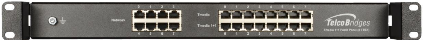
Tmedia TSG800-RJ 1+1, Patch Panel (front view)