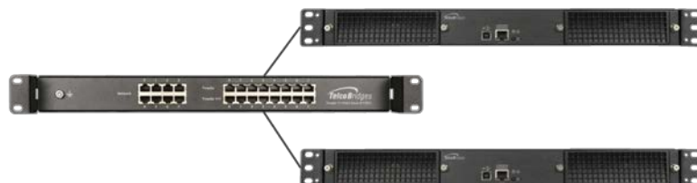
Tsig 1+1 solution schematic

MF R1 (including E&M, loop start, ground start) MF R2 (including standard ITU, Brazil, Mexico, Venezuela) Customizable script files to implement any CAS variant