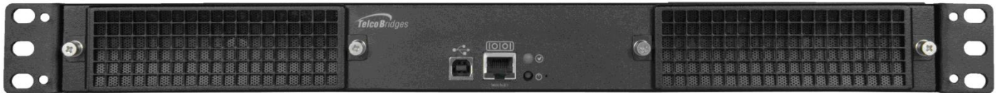
Tsig TSG3200 (front view)

Operating temperature: 0 to +70 °C, 95% rel. hum. non-condensing Storage temperature: -10 to +85 °C, 95% rel. hum. non-condensing Designed to meet NEBS Level 3 RoHS compliant