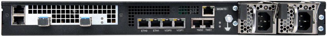
Tsig TSG3200-STM1 AC (rear view)