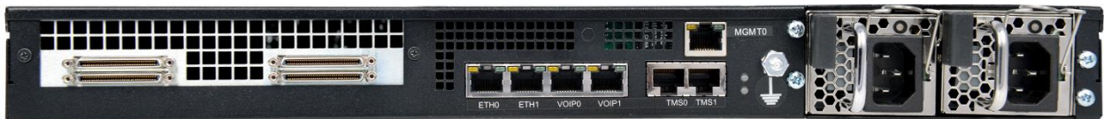
Tsig TSG3200-TE AC (rear view)