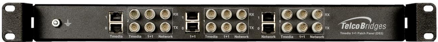
Tsig TSG3200-DS3 1+1, Patch Panel (front view)