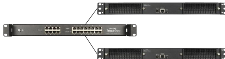
Tmedia 1+1 solution schematic

1 active Tmedia unit and 1 standby Tmedia unit 1 or 2 Tmedia 1+1 Patch Panel(s) 1+1 Patch Panels are passive (no power required)