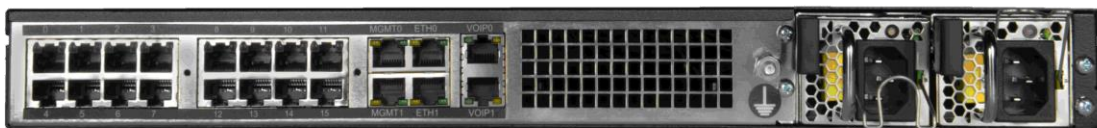
Tmedia TMG800 1U VoIP gateway, front and rear view (dual AC power input shown)