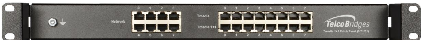
Tmedia TMG800-RJ 1+1, Patch Panel (front view)

1+1 Patch Panels are passive (no power required)